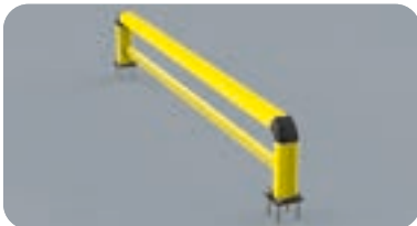
FE 150 REF 2400x550

Length 2.400 mm Packing unpacked on pallet Colour B M