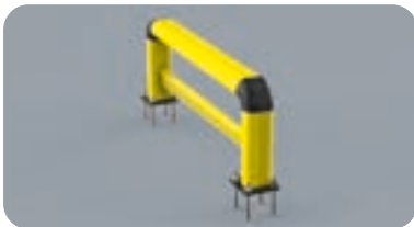
FE 150 REF 1100x550

Length 1.100 mm Packing unpacked on pallet Colour B M