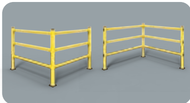
PED 90 1500x1150 CORNER