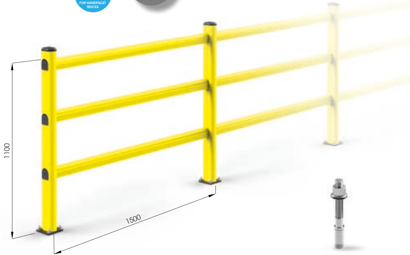
M12 GALVANISED STEEL