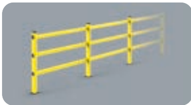
PED 90 1500x1150 MODULAR